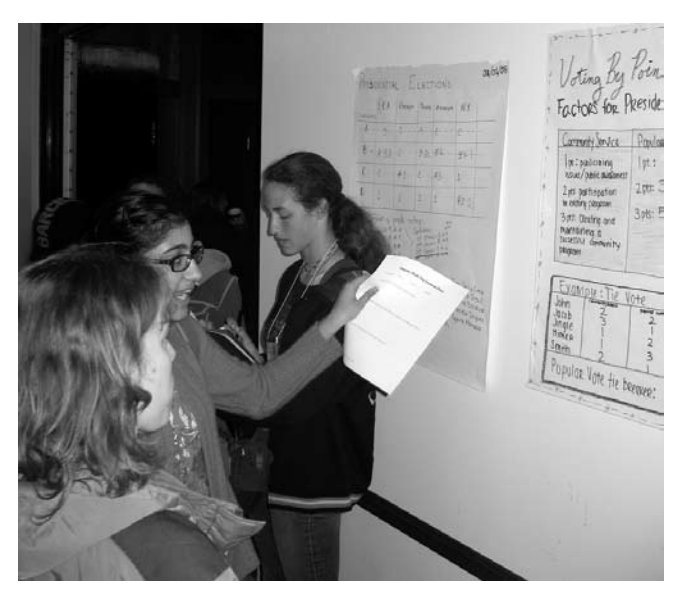
Figure 4: A student discusses the ideas behind her group's alternative voting system to her teacher.

Teachers also responded positively. One said that the activity "reminded me how enjoyable math can be for students," and pointed out how easy it is to not take the time to let students