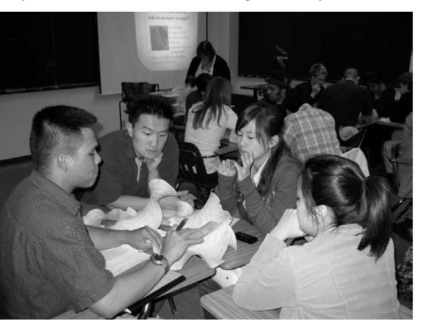
Figure 2: A group of pre-service teachers grapples with how to measure angles on a realization of the hyperbolic plane.

Each of the IMDs so far has been attended by about 80 high school students (grades 9 through 12) and 20 teachers from the great-