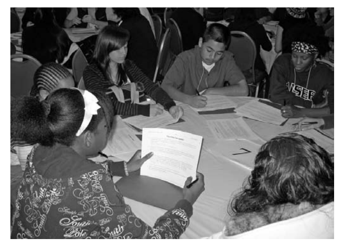
Figure 3: Participants of the 2008 IMD think about alternative systems for presidential elections.

This year, the topic was the mathematics of voting, an especially appropriate topic since it is an election year. After exploring how the choice of different voting procedures can have a dramatic impact on the outcome of an election, participants were given the task of creating their own voting paradoxes. During the afternoon, they were then given the open-ended task of